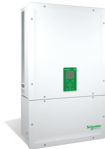
Products shown: Schneider Electric Conext CL with wiring box