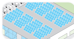
Commercial grid-tie centralised